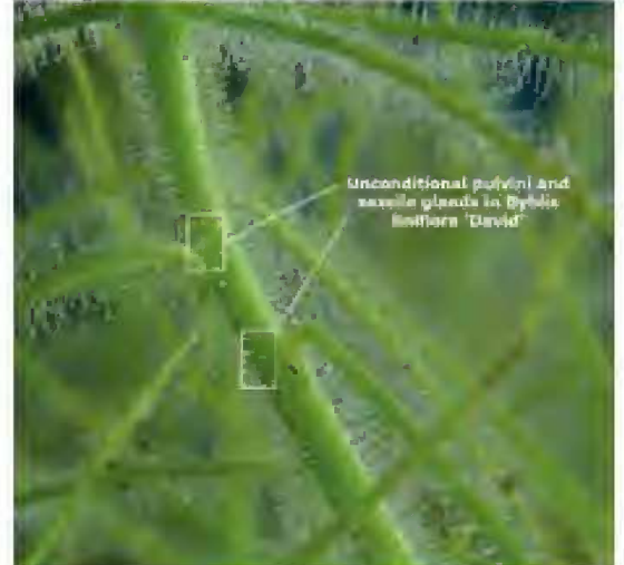
Figure 13: Byblis liniflora 'David' sessile glands.

Overall growing conditions have a great influence on the plant's flower structure. A comparison of sepal length to petal length unfortunately shows inconsistencies when compared to seedlings and clones in cultivation. The same inconsistencies exist when comparing filament to anther length. Anther coloration ranges from dark purple to light lavender, depending on the amount of sun received. Flower color ranges from light pink to dark purple. The back of the flowers range in color from white to tan or white with tan stripes. Striped and white flower forms are also known to exist. Equally important, overall growth habit and form is affected by lighting conditions, temperature differences, and moisture levels in cultivation. Therefore, one of the easiest ways to confirm that a plant is Byblis liniflora 'David' is the existence of unconditional pulvini and sessile glands.